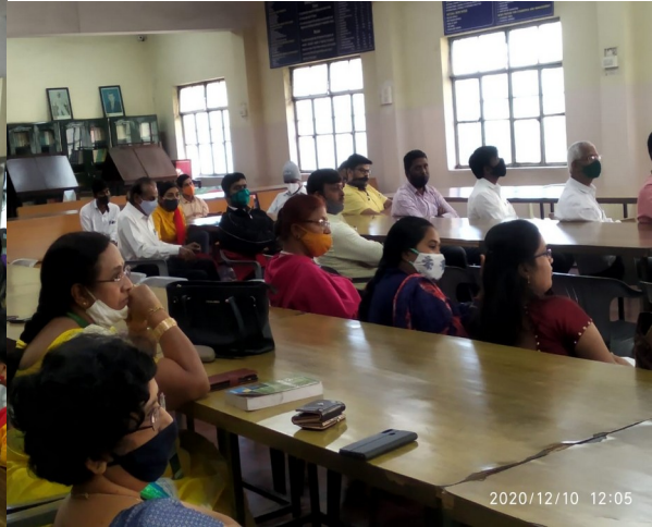
Convener Women Empowerment Cell