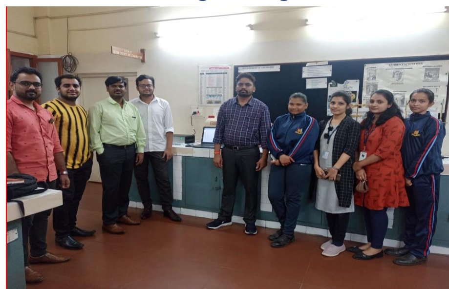
Workshop on Cyclic Voltammetry at mLAC