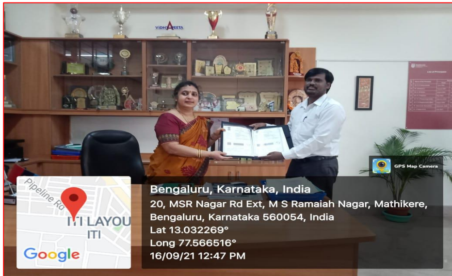
MoU Collaboration Between SJR & MS Ramaiah College