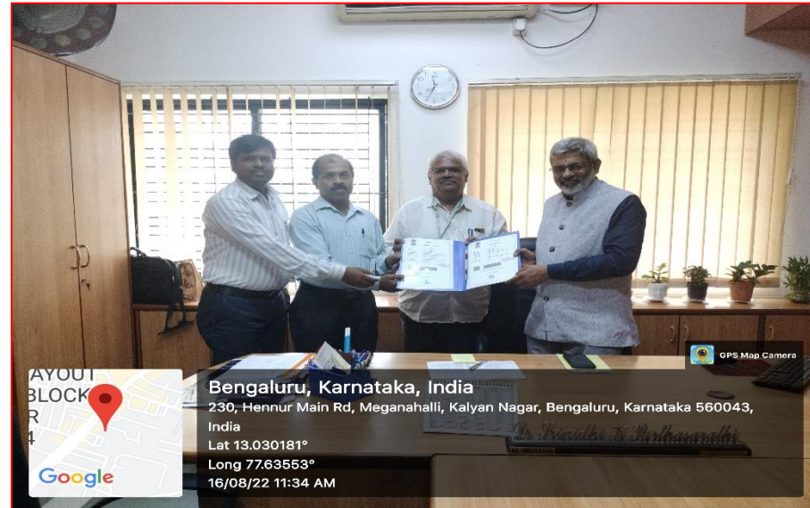
MoU Collaboration Between SJR & Indian Academy degree college