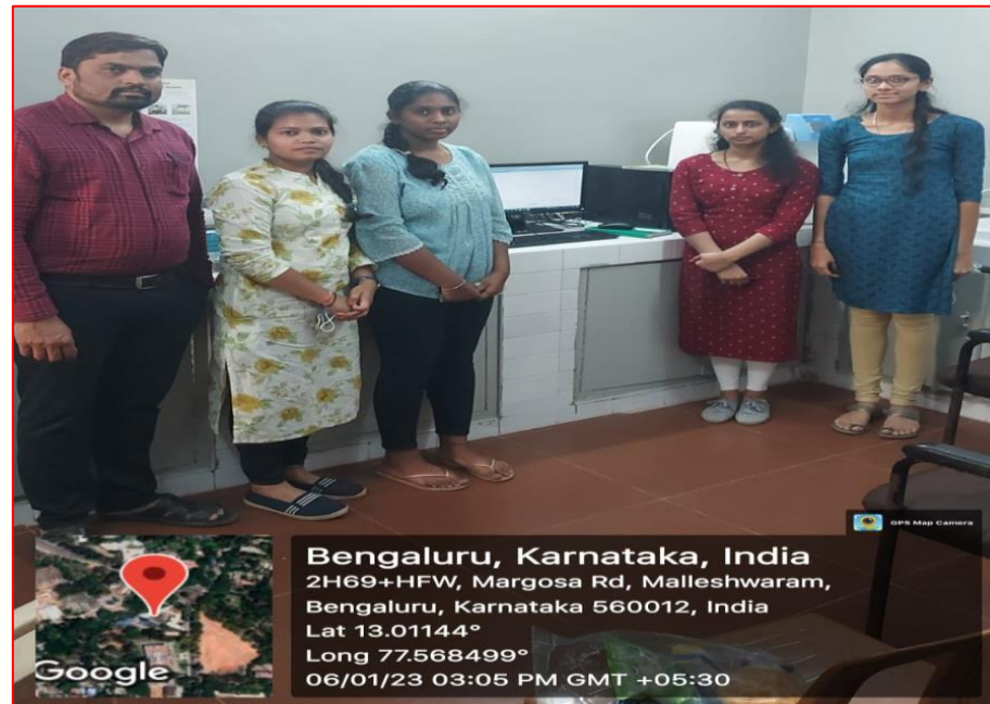
Students involved in Research project at mLAC