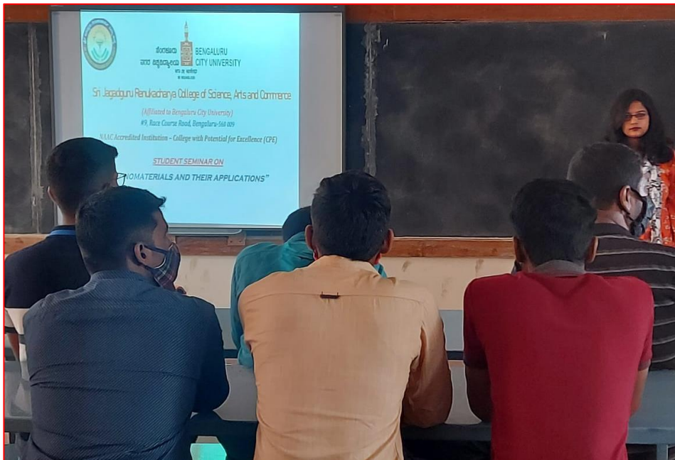
Student Seminar on Nanomaterials and their applications