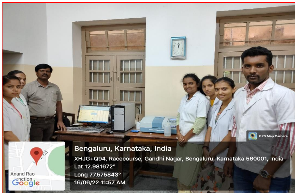
Research Activity on UV-Visible Spectrophotometer