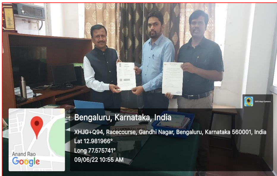
MoU Collaboration Between SJR & mLAC